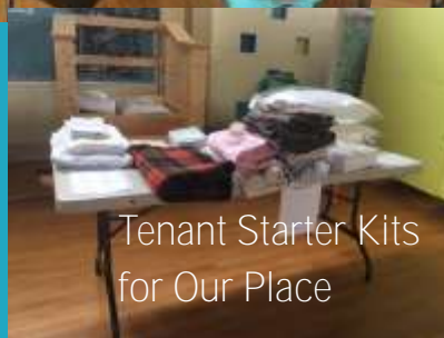
Tenant Starter Kits for Our Place