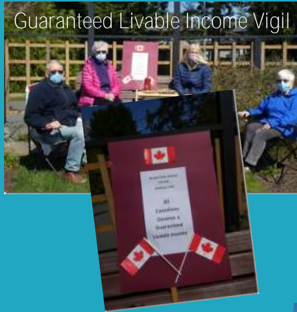
Guaranteed Livable Income Vigil