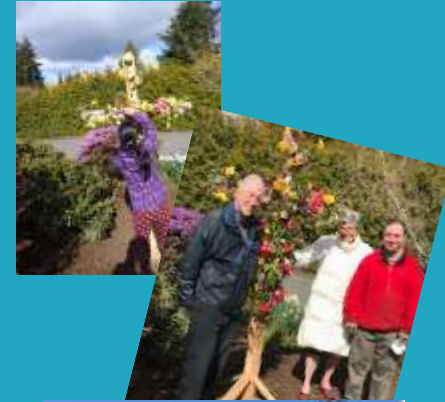
Flowering Cross for Easter